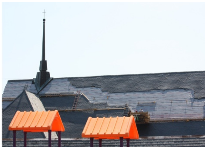
Much needed roof repairs underway...